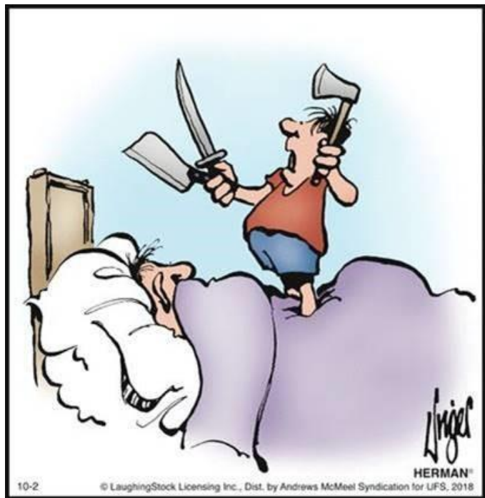
“Dad, watch me juggle!”

A man and a woman were travelling in a train. Woman: “Every time you smile, I feel like inviting you to my place.” Man: “Awwwww.....! Are you single?” Woman: “No, I’m a Dentist.”