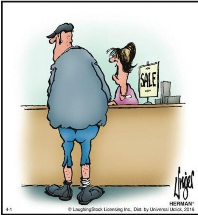
“Linda, those pants we had on sale... were they machine washable?”