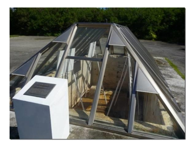
"Atomic Bomb Pit #2" Where Fat Man was loaded onto Bockscar

There are pictures inside the enclosure showing the loading of the bombs.