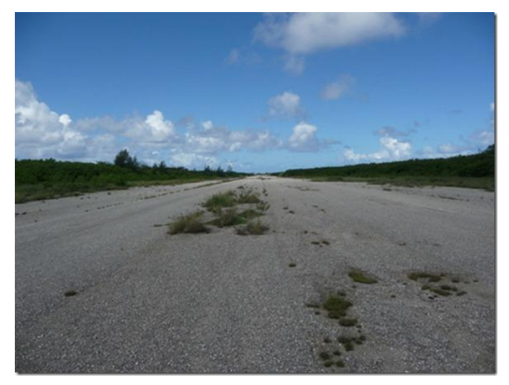
This is Runway Able

On the ground, you see the runway is not dirt but tarmac and crushed limestone, abandoned with weeds sticking out of it. Yet this is arguably the most historical airstrip on earth. This is where World War II was won.