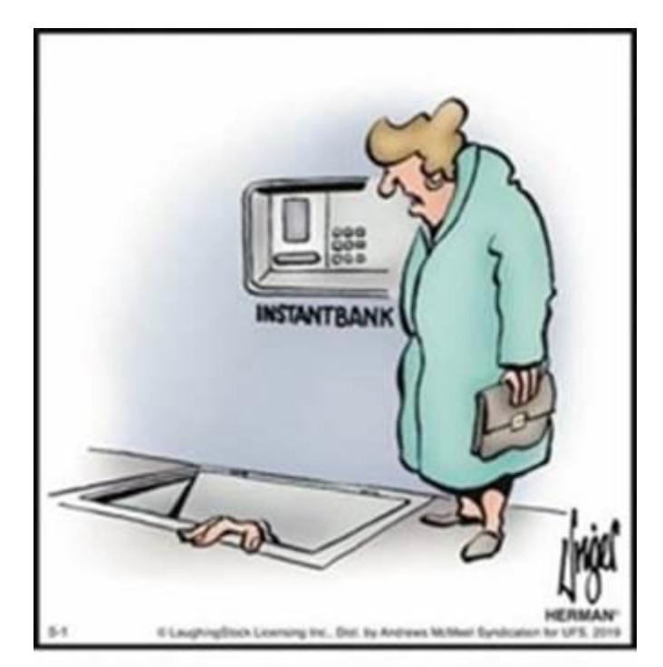
"Maybe your account's overdrawn!"

Southport RSL Sub-Branch Inc. Corner Marine Parade & Queen Street PO Box 31 SOUTHPORT BC QLD 4215 T 0484 280 750 E secretary@southport.rslqld.net.au W www.southportrsl.org