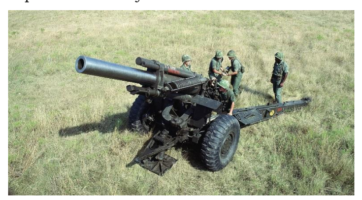
US Army 155mm Howitzer

1st Australian Task Force, Nui Dat, Vietnam, circa July 1969. US 155 mm Artillery firing 45kg High Explosive shells during heavy rainfall over the 106 Field Workshop RAEME, but explosions directly over Vehicle Platoon.