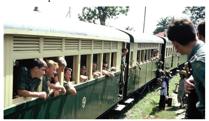
Troop Train to Tenom

were not allowed to shoot them, we decided to throw rocks at them to scare them off. That worked at first, but when the rocks came back faster than we could throw them, we thought it best to stop that deterrent.