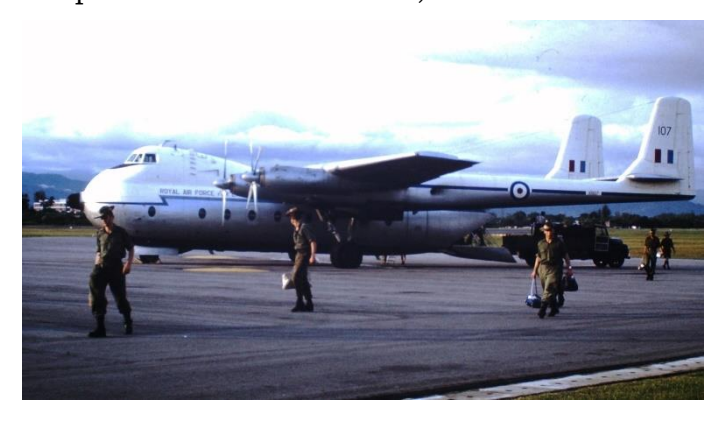
Arriving in Borneo

However, that is all water under the bridge now. At the time, Borneo rolled on with Australian Troops rotating through a window of six-to-nine-month service, mostly RAE, as they needed tradesman to build more accommodation, for the forward camps, water points with purification units running, power generator and helipads and in some cases, assault boats.